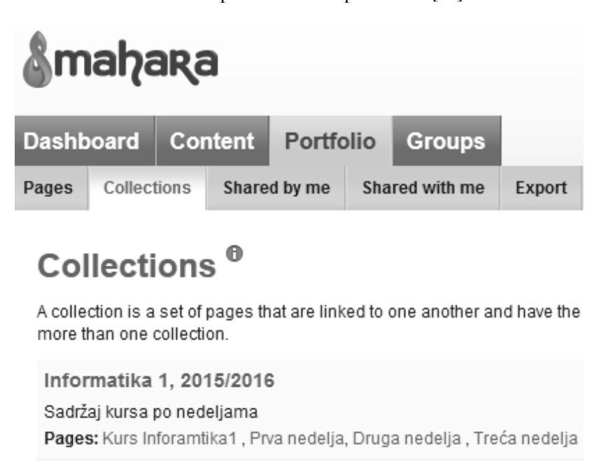
Figure 2: Lists of collections in Mahara

(Figure 2). Finally, the platform offers a range of possibilities for portfolio sharing and allows forming of discussion groups, as well as their own accounts and profiles. The interface is largely applicable and is suitable for implementation for users with different levels of computer skills [12].